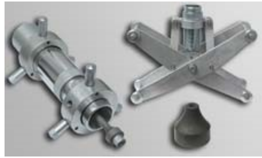
ID BLASTING System