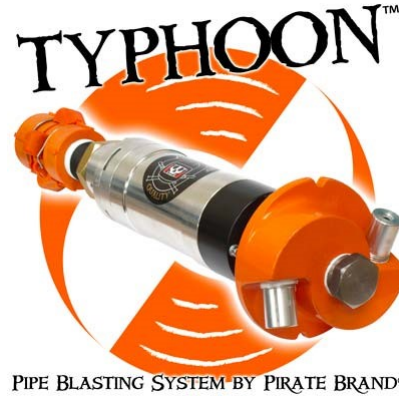
PIPE BLASTING SYSTEM BY PIRATE BRAND®