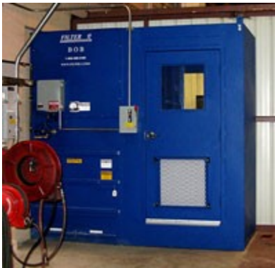
BOB Blow -OFF -Booth