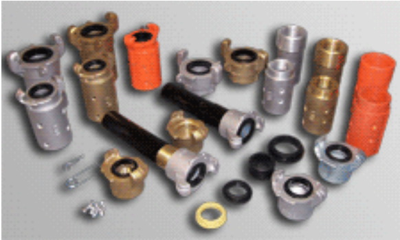
BLAST & AIR HOSE