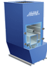
Hydrotron Wet Collector