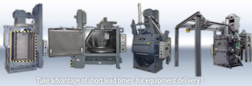
Take advantage of short lead times for equipment delivery!

For over eighteen years, Gibson has been a trusted partner in the wheel blast equipment industry. Our 100% focus on shot-blasting solutions has made us good at what we do!