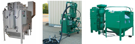
Automation Portable Blasting Blast Cabinets