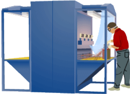
Double Benchtron Grinding

US BLAST & Filter 1 Offer a complete line of dust collectors, booths, downdraft tables, air cleaners, and wet type systems. Our engineers specialize in customizing products to meet all kinds of industrial requirements.